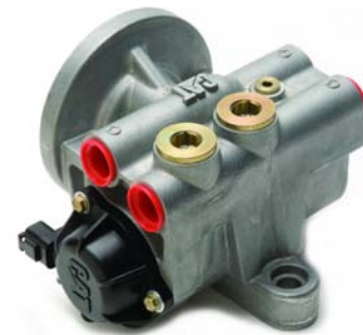
Cat Electronic PrimeTime Priming Pump