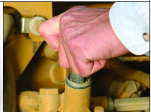
Manual Priming Pump